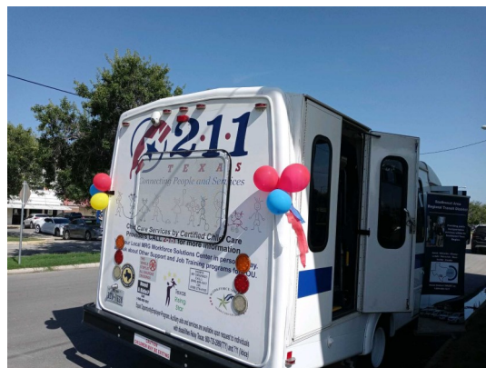
Crystal City Kids—Middle Rio Grande Development Council 8/16/2021