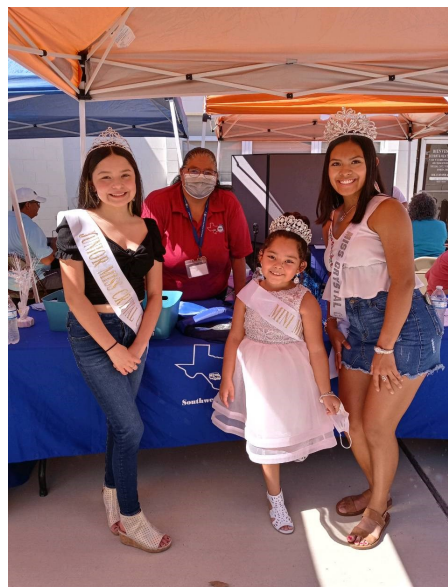
Crystal City Centro De Salud Fair 8/13/2021